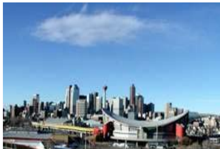
The Calgary Skyline

Host Hotel: Hyatt Regency Calgary Reservations Tel: (800) 233-1234 www.hyattregencycalgary.com