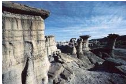
Drumheller Badlands 'Hoodoos'

Or, for something totally different - especially if you have kids - drive 2 hours NE from Calgary to the Drumheller Badlands and visit the Tyrell Dinosaur Museum - the largest dinosaur site in the world.