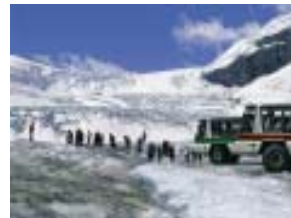
SnoCoach Tour (that 'is' summer time)

- half way there take a Sno-Coach tour of the Icefields glaciers