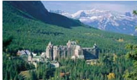
Banff Springs Hotel

- have lunch at the fabulous Banff Springs Hotel....truly a fairy tale castle ....or stay - rooms start @ $459 / night!